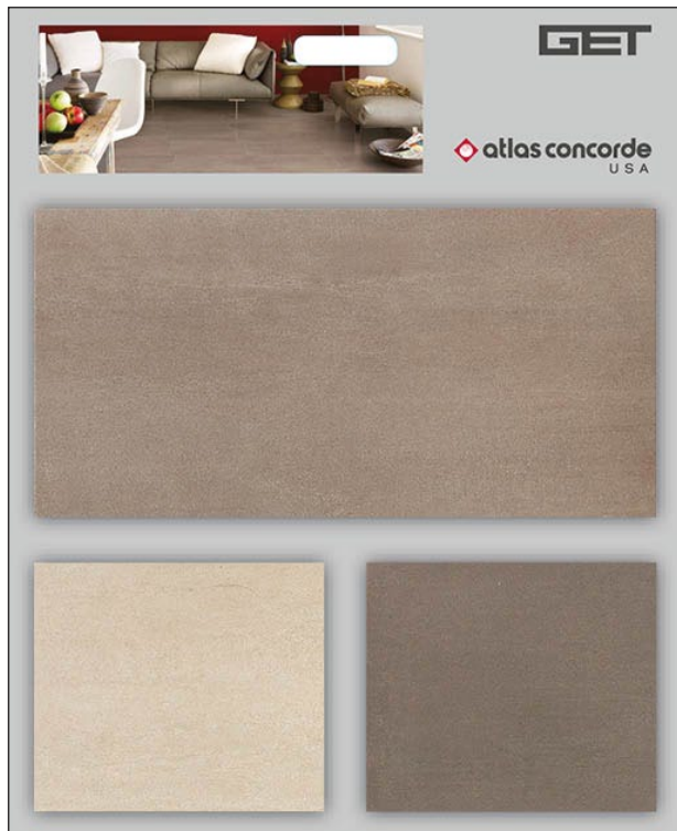
BOARD 25 5/8" x 31 1/2"