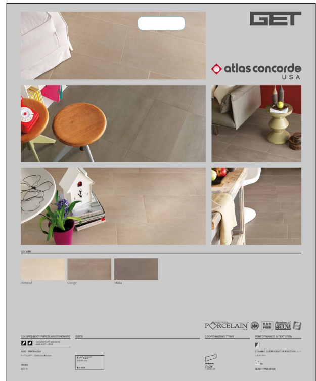
BOARD 25 5/8" x 31 1/2"

600010000915 GET ACU MOKA 12X24 .....pcs.0,5 600010000913 GET ACU GREIGE 12X24 .....pcs.1,0 600010000913 GET ACU ALMOND 12X24 .....pcs.0,5