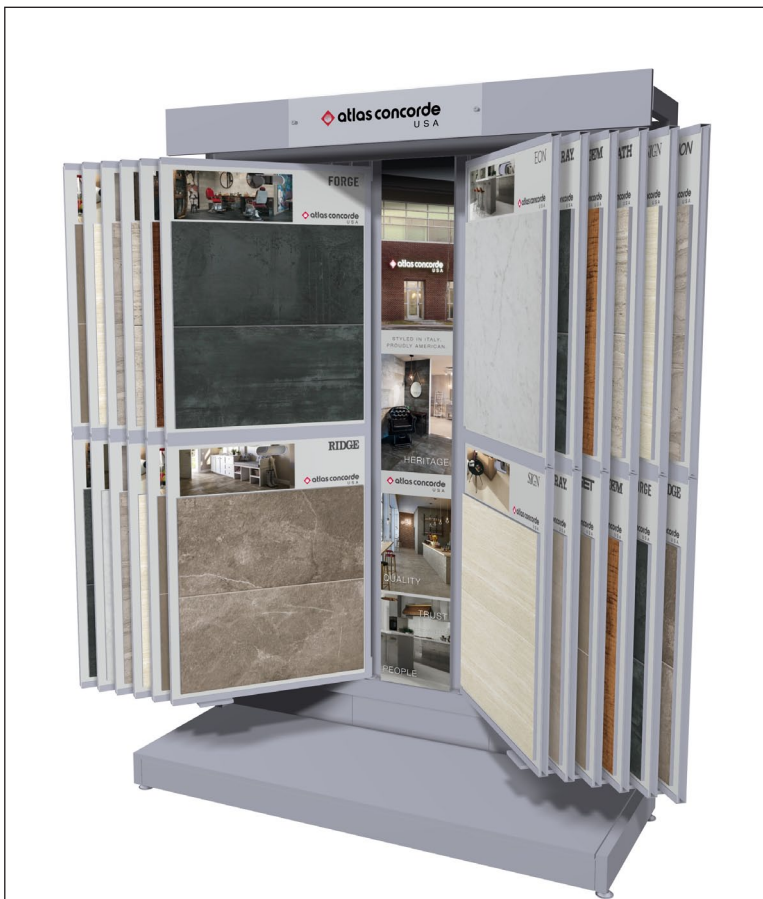
55003000036 WING RACK DISPLAY 12 wings, 4 slots each. Total capacity: 48 boards Recommended to be used with Product Boards (Floor, Wall) and Visual Boards Central visual panel with magnetic fasteners.