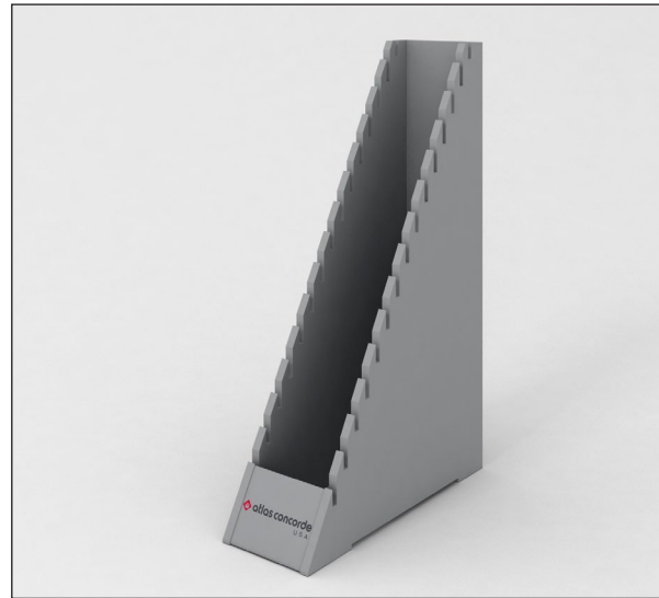
55006000011 WATERFALL CULLA 15PCS

Recommended to be used with Sampling Boxes or Product Boards (Floor, Wall)