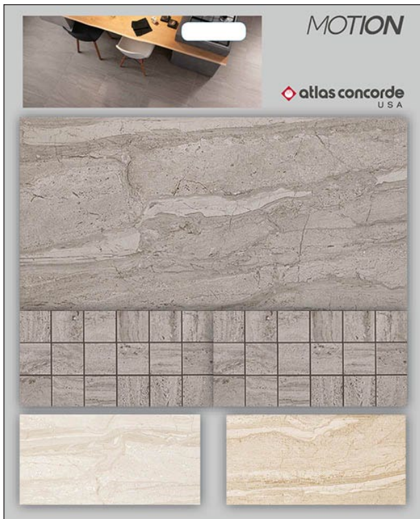
BOARD 25 5/8" x 31 1/2"

550040000048 BOARD MOTION FLOOR 25,6X31,5