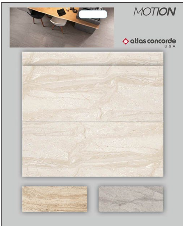
BOARD 25 5/8" x 31 1/2"

550040000049 BOARD MOTION WALL 25,6X31,5