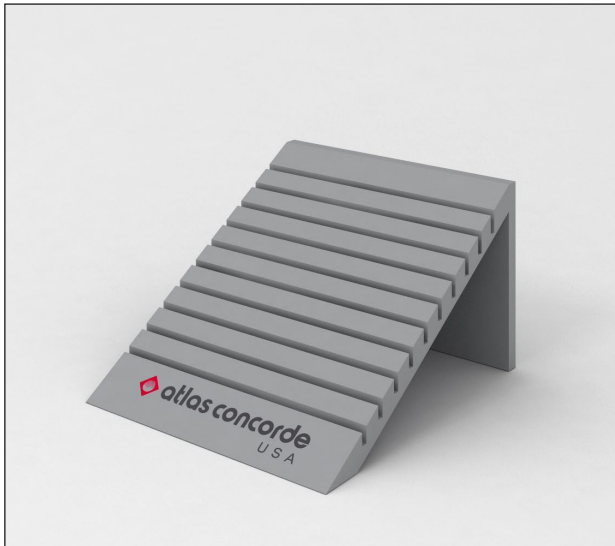
55006000010 GENERIC CULLA 10PCS