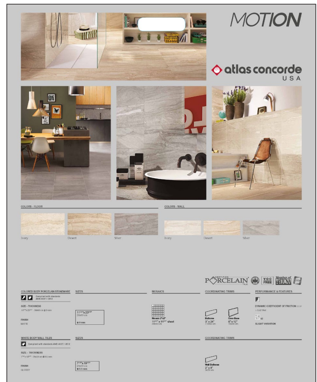
BOARD 25 5/8" x 31 1/2"