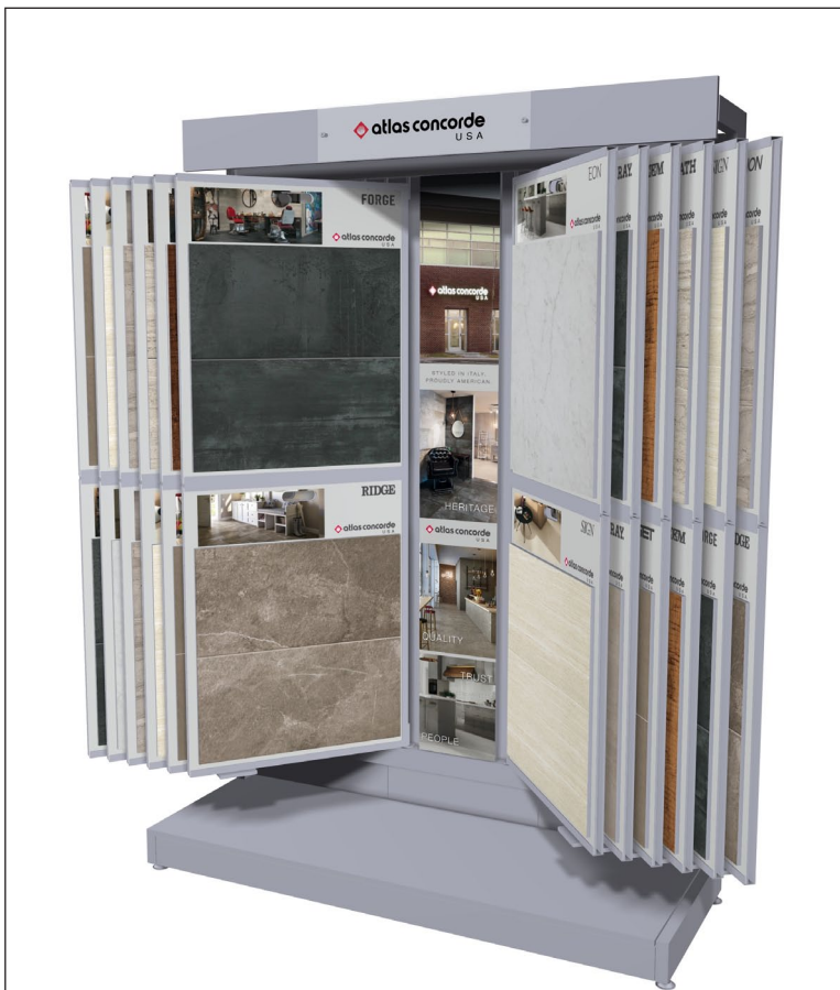
55003000036 WING RACK DISPLAY

Recommended to be used with Sampling Boxes (12"x24" tiles)